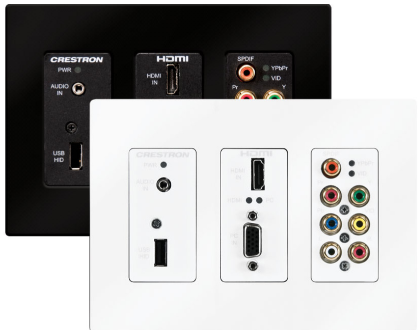
Faceplates not included.

The DM-TX-400-3G provides versatile switching among four inputs. The inputs can be configured to switch automatically or be selected through a Crestron control system.