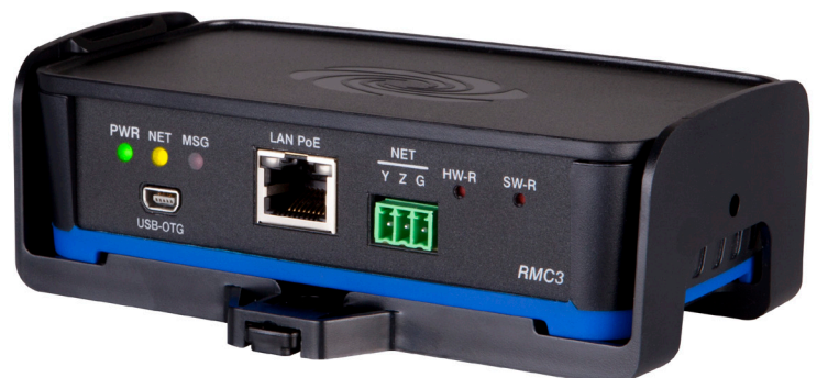
Shown with mounting bracket

The RMC3 features the Crestron IFE form factor, a compact "Integrator Friendly Enclosure" design that fits almost anywhere and enables a variety of installation options. Its shape allows multiple RMC3s and other IFE compliant devices to be stacked together. Using the included mounting bracket, it can be fastened to any flat surface or snapped onto a standard DIN rail. Rack mount and pole mount kits are also available. [4]