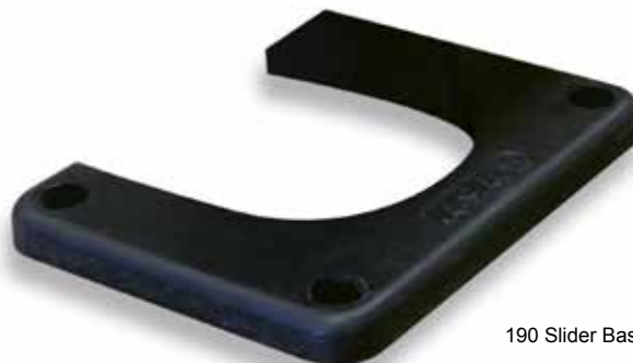
190 Slider Base Plate

Find out more, contact sales +44 (0) 1422 331133, email sales@asafe.com or visit www.asafe.com