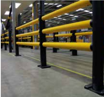
130 Slider Base Plate