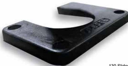
130 Slider Base Plate