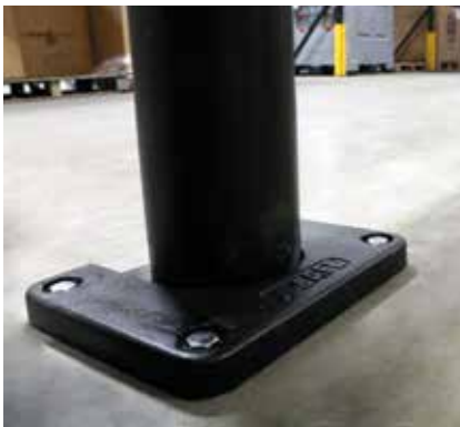
130 Slider Base Plate