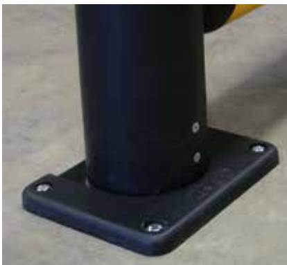
190 Slider Plate