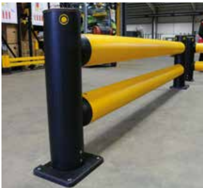
190 Slider Plate